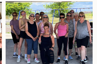
Summer time fun - 2022 🌿

All prices include HST. Register online & in class. $10. drop in option with a minimum of 4x classes purchased or if there's only, 1 - 3 classes left.