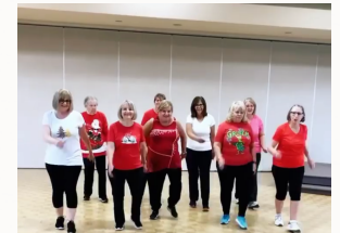
Beautiful Christmas, 2019 memories 🎄 🕊️ ❤️