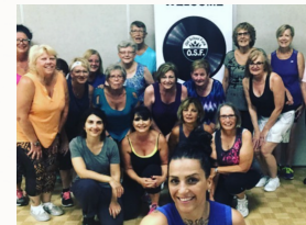
Incredible moments to remember 2018 🌹 🎵