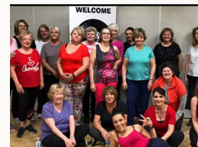
Stronger together 2017 ∞ 🌸