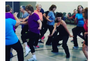
Mannequin challenge 2016 🗺️ 🕒